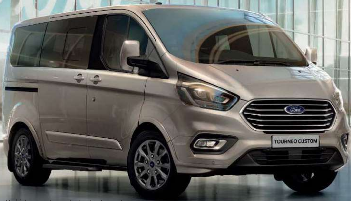
Model shown is a Tourneo Custom L1 Titanium X in Diffused Silver metallic body colour (option) with 17" 10 spoke Dark Tarnish alloy wheels (option).