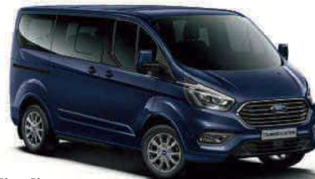
Blazer Blue Solid body colour