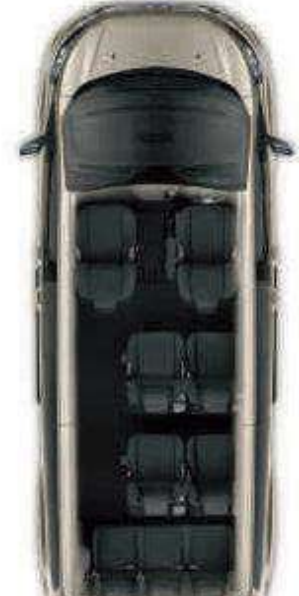
Tourneo Custom Shuttle Bus 9 seats L2.

Main image (left): Model shown is a Tourneo Custom Titanium with Salerno leather trim in Palazzo Grey.