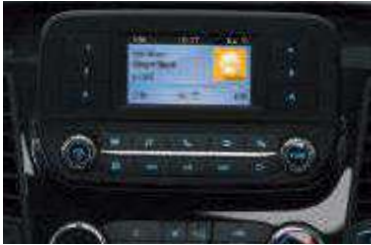
ICE Pack 18 - AM/FM audio with SYNC with 4.2" TFT display (Standard)

*Note: A rear-facing child seat should never be placed in the front passenger seat when the Ford vehicle is equipped with an operational front passenger's airbag. The safest place for children is properly restrained on the second-row seats.