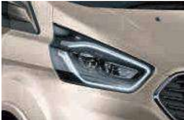
High Intensity Discharge headlights (standard)