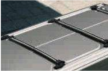
Integrated roof rack (Option)