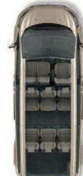
Tourneo Custom 9 seats L2.