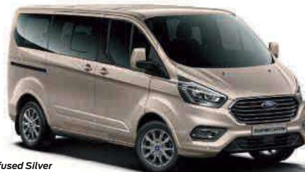
Diffused Silver Metallic body colour*