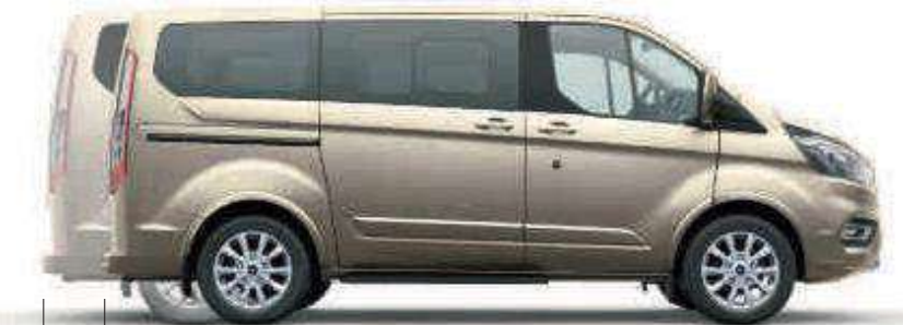
Tourneo Custom L1.

With a focus on passenger comfort, the Tourneo Custom Shuttle Bus L2 offers generous space in each of its four rows of Direct Access Seats. Rear seating is easily reached from the kerb-side sliding side door, and it's the ideal way to prioritise passenger comfort and mobility over luggage space.