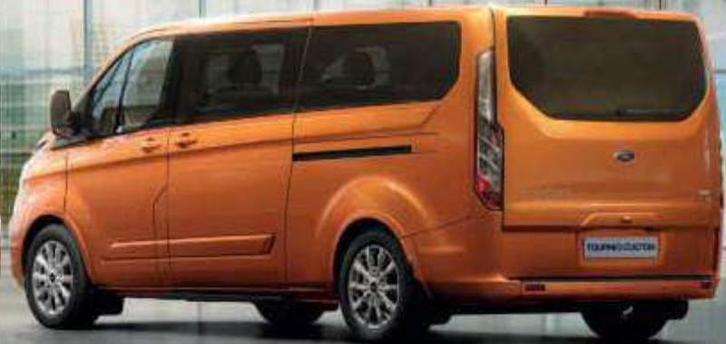
Model shown is a Tourneo Custom L2 Titanium in Orange Glow metallic body colour (option) with 17" 10-spoke silver alloy wheels (standard).