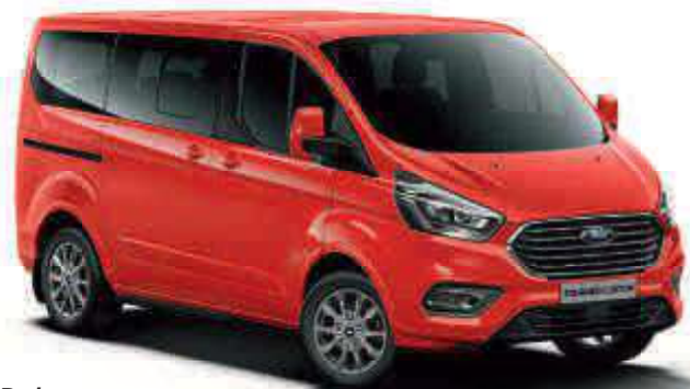
Race Red Solid body colour