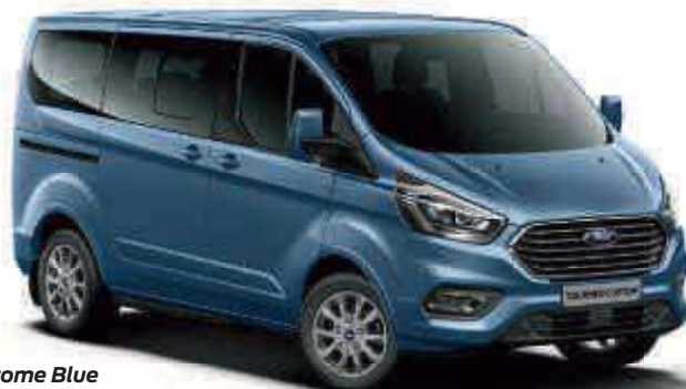
Chrome Blue Metallic body colour*