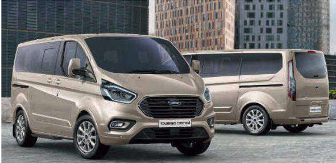
Model shown is a Tourneo Custom Titanium X L1 in Diffused Silver metallic body colour (option).