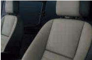
Leather seat trim (Option)