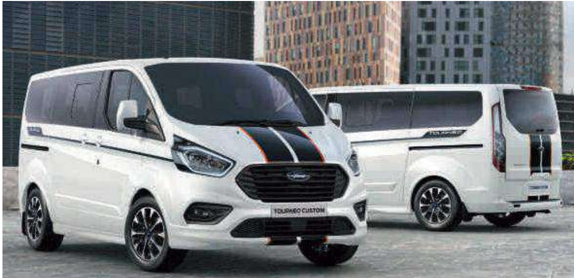
Model shown is a Tourneo Custom Sport L1 in Frozen White solid body colour and High Intensity Discharge headlights (option).