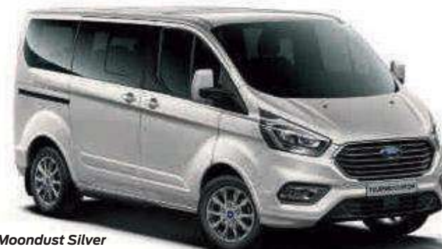
Moondust Silver Metallic body colour*

We chose Diffused Silver. What will you choose?