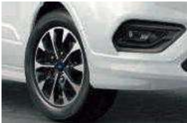
17" 5x2-spoke bright machined black alloy wheels (standard)

Race Red, Chrome Blue and Orange Glow body colours get black stripes with silver accents.