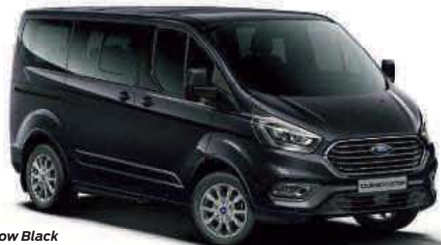
Shadow Black Mica body colour*