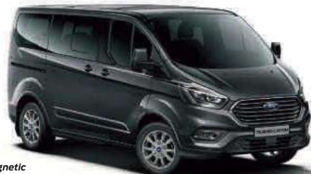
Magnetic Metallic body colour*