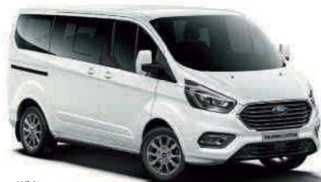
Frozen White Solid body colour