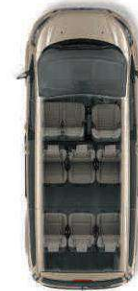
Tourneo Custom 9 seats L1.