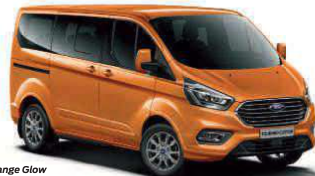
Orange Glow Metallic body colour*