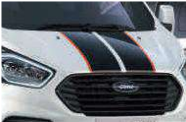
Sport stripes and grille (standard)

Frozen White, Shadow Black, Magnetic and Moondust Silver body colours get black stripes with orange accents (as above).