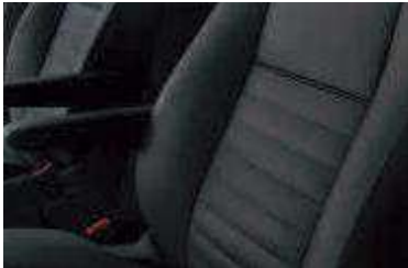
Leather trim (standard)

*Ford Emergency Assistance is an innovative SYNC feature that uses a Bluetooth®-paired and connected mobile phone to help vehicle occupants initiate a call to the local Communications Centre, following a vehicle crash event involving an airbag deployment or fuel pump shut off. The feature operates in more than 40 European countries and regions.