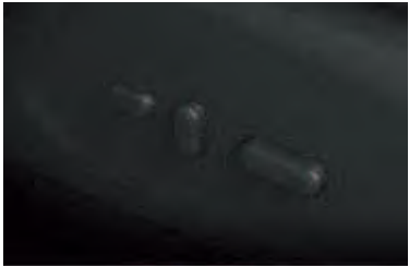
Power-operated and heated driver's seat (Option)

*Ford Emergency Assistance is an innovative SYNC feature that uses a Bluetooth®-paired and connected mobile phone to help vehicle occupants initiate a call to the local Communications Centre, following a vehicle crash event involving an airbag deployment or fuel pump shut off. The feature operates in more than 40 European countries and regions.