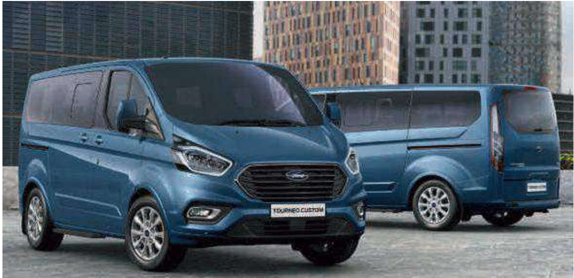
Model shown is a Tourneo Custom Titanium L1 in Chrome Blue metallic body colour (option).