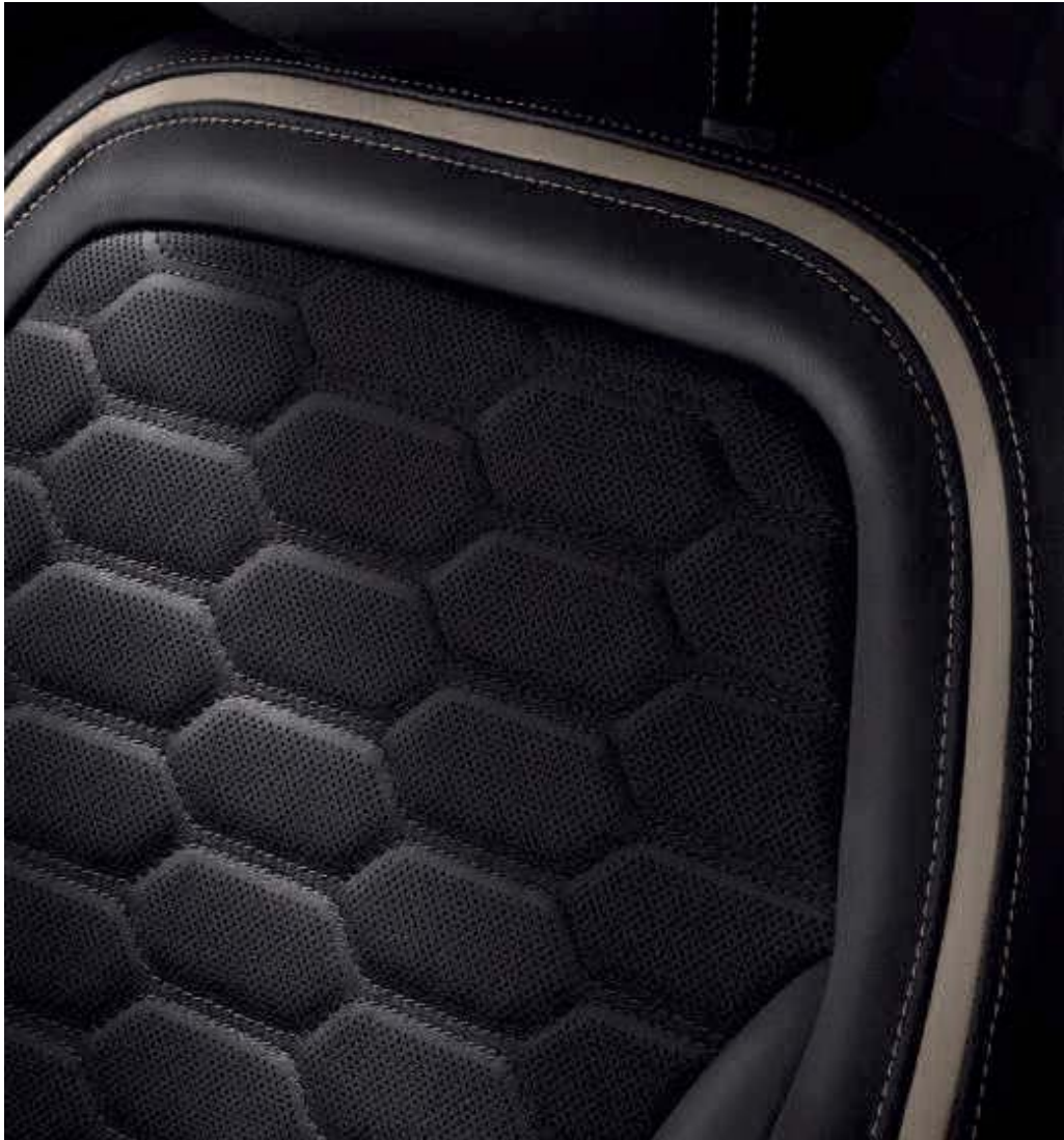
Main image Unique Ford Vignale design quilted leather seat trim. Above right Ford Vignale exterior badging. Below right Premium leather-finished facia (excluding Fiesta).