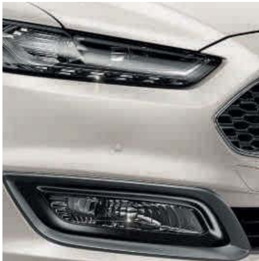
Top left Exquisitely stitched leather finish. Top right Unique Ford Vignale front grille. Below left Premium leather-finished facia (excluding Fiesta). Below right LED Adaptive Headlights (excluding Fiesta).